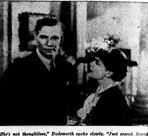
"She's not thoughtless," Dodsworth spoke slowly. "Just scared. Scared of growing old."

CHAPTER 4 Dodsworth, as usual, gave in to Fran. He returned home without her. His friends were shocked when they greeted him. He had aged ten years.