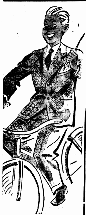
Suits For Juveniles

The less conservative coat for Juniors, in English tweeds, down-teen, fleece, camel hair and wool. Collarless, lined and unlined, single and double breasted styles. Raglan and well-gored for fit with deep armholes. Also the snug form fitting type. Comfortable and warm. In full sizes 11 to 17.