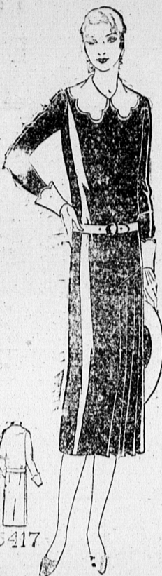
Smart simplicity for the college miss is this rust-red wool jersey