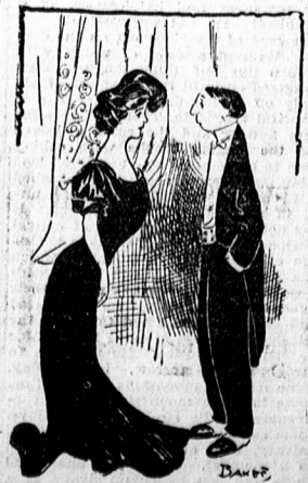
WOULDN'T HAVE THE NERVE OTHERWISE.

A glance throughout our two mammoth stores will disclose values in every line that will at once impress you with their extraordinary nature. Not a few pieces, but everything, has been cut to a point that represents a saving to you of from 1/2 to 3/4. It is a chance for economical home- furnishing that must appeal to every household.—Jas Paton & Co. 5d 1f