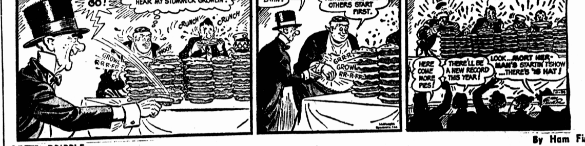
By Ham Fisher