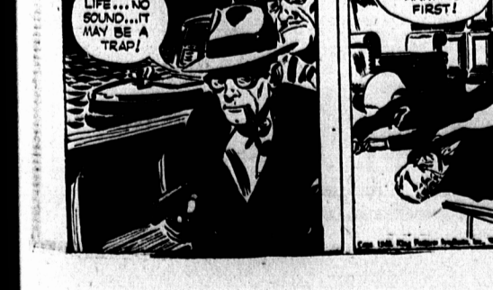
By Alex Raymond