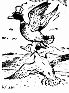
Early the next morning Mr. Quack led the way up the Big River