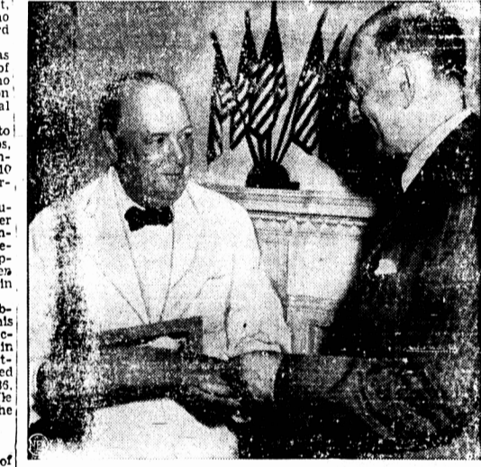
Before a battery of lights and cameras in the White House, Third War Loan Drive was opened by Prime Minister Winston Churchill's purchase of the first bond from Secretary of the Treasury Henry Morgenthau, right. He said he would turn over the bond to Mrs Churchill to be sold for her Russian war relief fund.