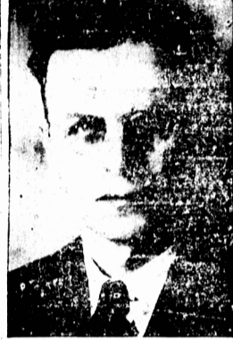
HON. WILLIAM M. HUGHES