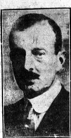
Above is shown Grand Duke Cyril, cousin of the late Czar Nicholas II, and claimant to the throne.

HOME MADE POTTED MEAT, Fresh sausages, Saunders, Newsum & Co., East End Market Bldg.