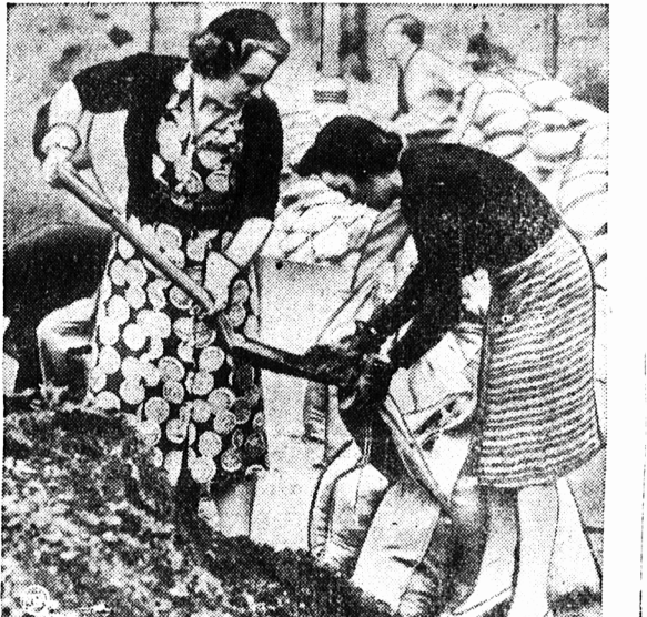
Helping to build air raid defenses in British cities is vital wartime duty for British women. Those above are at their daily chore of filling sandbags in the Kensington section of London.