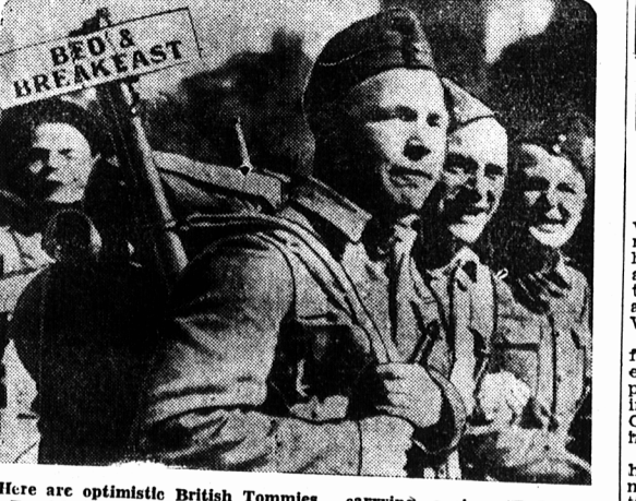
Here are optimistic British Tommies carrying a sign "Bed and Breakfast," as the march toward an embarkation point in England for service in France. This photo cabled from London, proves the troops are not worrying about what the accommodations will be like when they reach the other side of the English Channel.