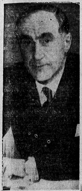
MEETS WAR GUESTS

Moscow reports defenders of Leningrad still unbeaten.