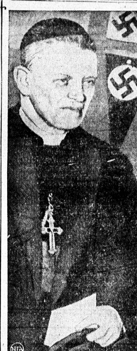
EDEN MAKES APPEAL