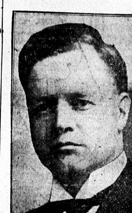
HON. DR. R. J. MANION