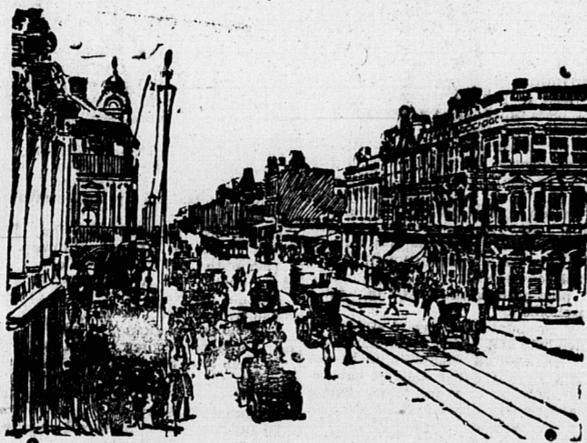
STREET SCENE IN JOHANNESBURG.