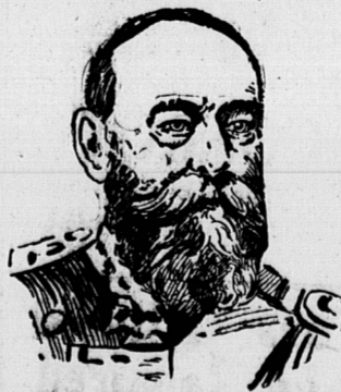
RUSSIAN VICE-ADMIRAL ALEKIEF.