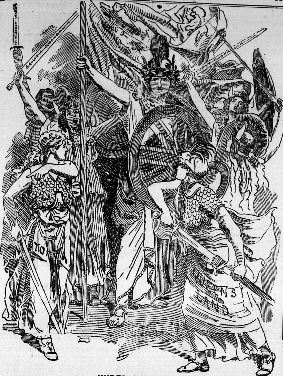
UNDER ONE FLAG.