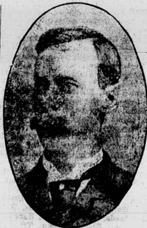
HON. NELSON MONROITH.