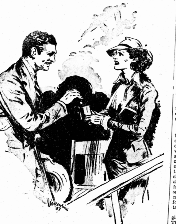
There was a sharp sound of some thing falling into the cup.

Continued. "We are snapped Carol. Speak for yourself, gal, said Grandfather Clayton. 'I ain't neither is Hartley. He's getting wise to himself—about time, too, after all the bum steers you've been 'fishing out.'"