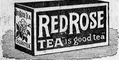
Red Rose Coffee is as generously good as Red Rose Tea

Ask your grocer for Red Rose Tea in the sealed carton.