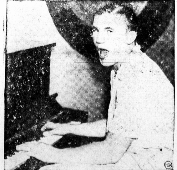
A song at twilight helps the challenger hold his temper.