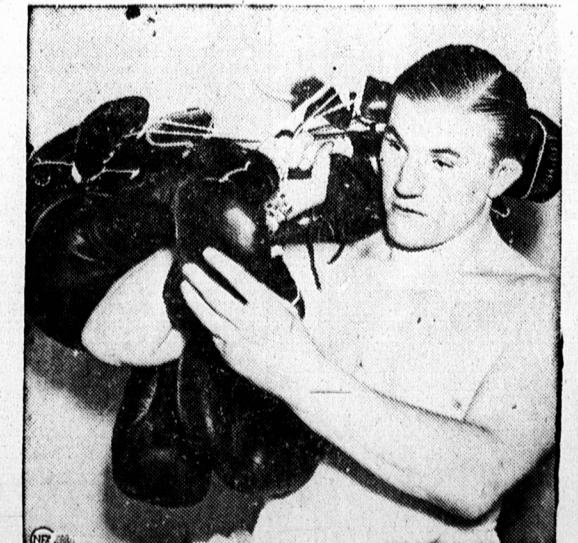
Tommy Farr asserts that Joe Louis will get all of them, Aug. 26.

Louis Target Admits He Is Tough, So Let Him Prove It