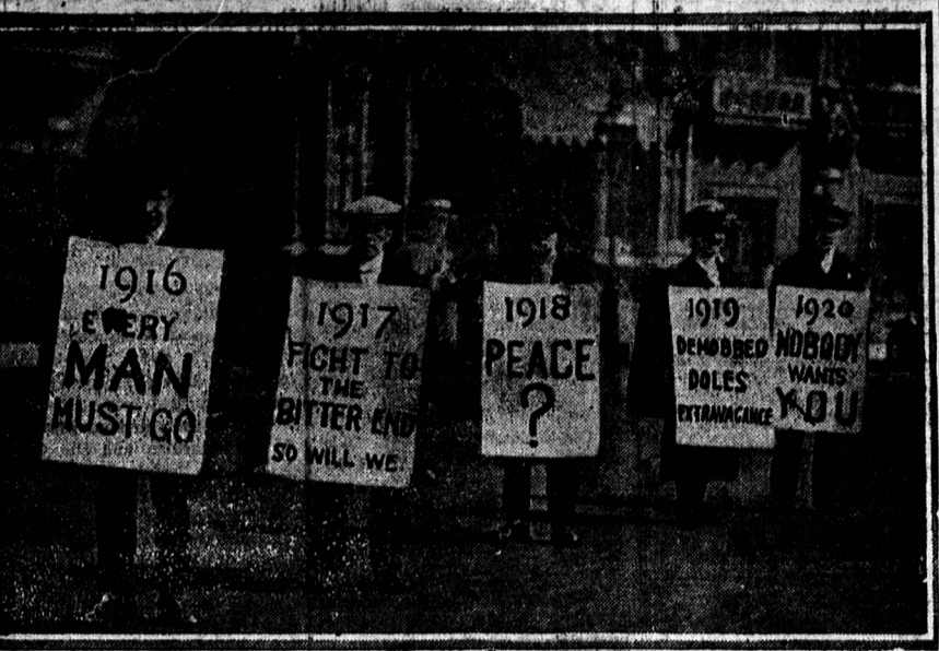
England has several post-war of the men who helped defeat the union parading in London outside problems that are difficult of solution...