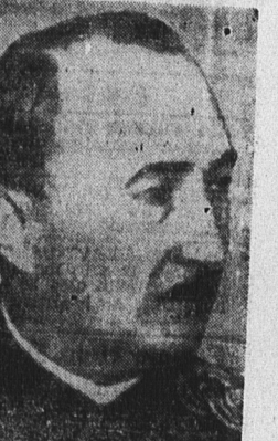
Yugoslavia informed Germany that fulfillment of the terms of the Axis pact would be "impossible because it would be contrary to the will of the Yugoslav people," high diplomatic circles report. TOP is the nation's boy King Peter, and BOTTOM, General Dusan Simovic premier, who defied Adolf Hitler.