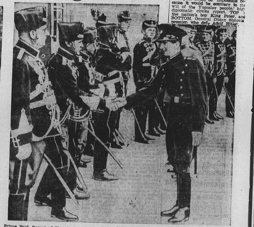
Prince Paul, Regent of Yugoslavia until the recent coup overthrew his regime, is in this picture — but hard to find. The photo shows King Peter II, right, greeting members of the Royal Guard in celebration in Belgrade. Regent Paul is directly behind Peter, almost eclipsed, prophetically enough, the 17-year-old boy King who has replaced him as official ruler of the country.

Through a screen of censorship which cut Yugoslavia from communication with the outside world, came the news that army leaders have overthrown the subservient government which signed a pact with Hitler, and that 17-year-old King Peter had proclaimed himself a monarch in his own right. Queen Marie of Rumania, about the time his father was assassinated on a visit to France. At SECOND LEFT is a picture of Peter at school in England, where he is, and at RIGHT, boxing with his cousin, Prince Alexander.