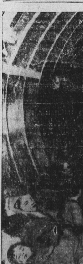
With Britons defending their very homes, England's Christmas season was not gay. But all Goring's bombers and fighters could not down the red-wood sleigh piloted by Santa Claus...