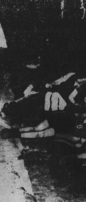
crowded air raid shelter, distributing gifts, and thrilling the youngsters by his raucous presence. Most of them were "good little children" who dutifully remained asleep. But the bold young fellow at left sat straight up, determined to get a good look.