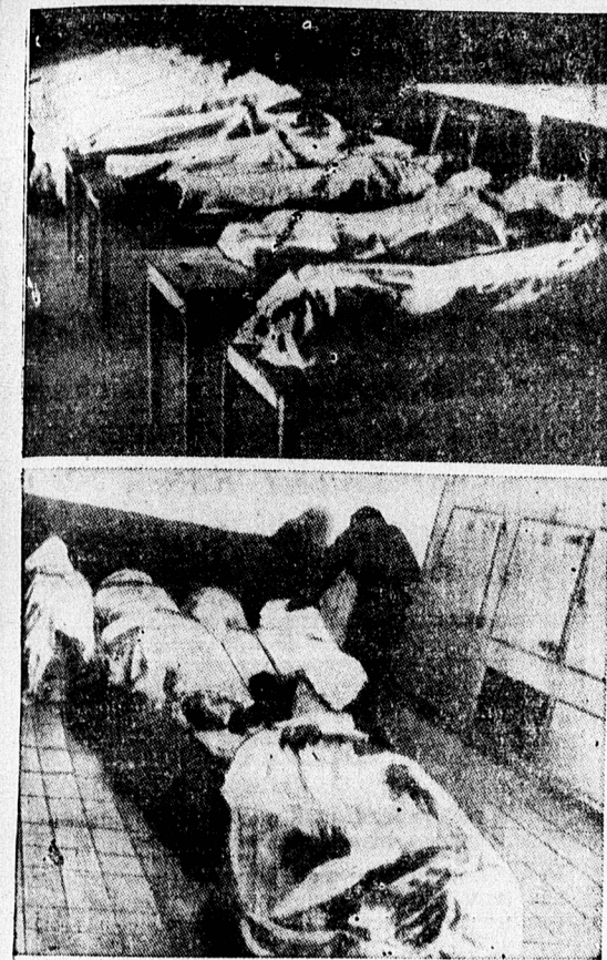
Tragic aftermath of the first German air raid on Paris are these two pictures, according to French caption. Censor describes top photo as bodies of school children slain by Nazi bombs, lower one as other civilian victims among the 254 killed during the raid.

Oblivious to huge losses, German tanks and massed infantry advanced against the Weygand line again, June 6. Some French advance posts on the lower Somme were withdrawn to permit anti-tank manoeuvres fuller scope. Along the rest of the front, stretching from the coast to the Maginot line at Mentevy, the Nazis made no impression on the defence system planned by Gen. Weygand in the last two weeks. Organized in depth, French forces let tanks go past outposts, then closed in behind, moving down infantry advances while the tanks were blasted from concealed gun positions.