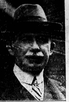
H. C. ROBERT ROGERS

Minister of Public Works in the Borden Cabinet announced definitely that he will contest a seat in the next general election.