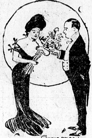
She—He can't act any more than a cow. He—That's why he's in a stock company.