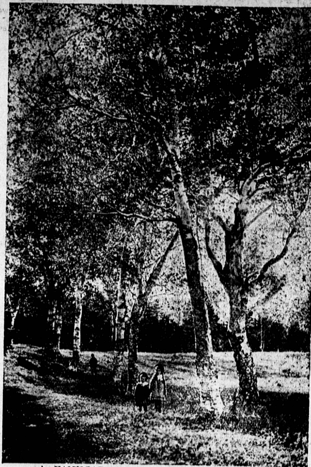
A FAMILIAR SPOT IN VICTORIA PARK.