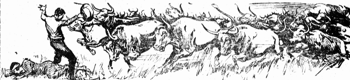
Red-eyed, foam-flecked, maddened, they came at him. It's a thrill never before shown on the screen.

MOORE & McLEOD, LTD., close at 6 p.m. Monday and Tuesday evenings, and will open for business, in the evenings, commencing WEDNESDAY, 21st inst. MOORE & McLEOD, LTD.