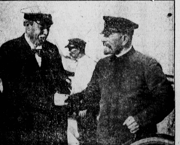
Sir Thomas Lipton, as gay as ever, greeting an old sea friend at the annual yachting regatta at C oves, England, which was attended as usual by the King and Queen.