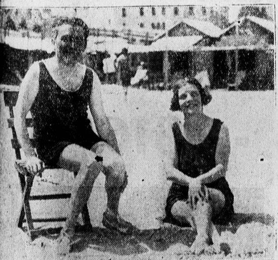
Miss Maud Allen, the famous Canadian dancer, and Morris Gest, the famous producer on the Benitlan Lido, the popular European summer resort.