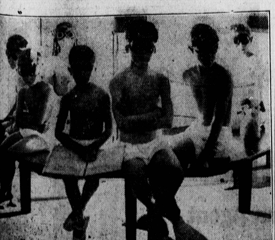
A new course of treatment has been established at the British Human Association's Sunlight Clinic in London, England, where children are subjected to very strong light in lieu of natural sunshine.