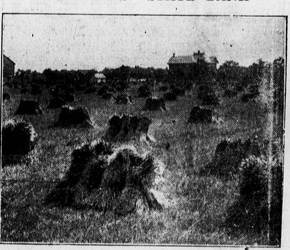
The grain fields all over Canada are now being harvested, and an army of sixty-nine thousand men are being employed in cutting the fields.