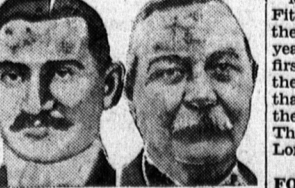
Oscar Slater (left) free from an English prison after serving over 18 years for murder. Through the efforts of Sir Arthur Conan Doyle (right) famous creator of Sherlock Holmes, Slater's innocence was finally proven after years of untiring effort.