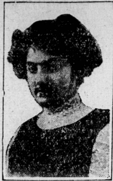
A HORRIBLE HAIRY MASK Completely Removed Without One Moment's Pain.

No longer need women suffer the terrible humiliation and embarrassment of a repulsive, hairy growth on the face, neck or hands, which gives the feminine face such a coarse, ugly, masculine and oftentimes positively repugnant appearance. For years I searched for a painless, simple and satisfactory way to remove superfluous hair from the skin, so that it need never return. Endless experiments and the experience of thousands of women who have undergone the barbarous torture of the electric needle, burning pastes and powders prove to me that these widely advertised treatments were for the most part dangerous in the extreme and seldom satisfactory in their results. Usually the unsightly growth returns in greatly aggravated form, and sometimes the victim's face is horribly scarred for life. Yet, I determined there must be a way and that I should find it.