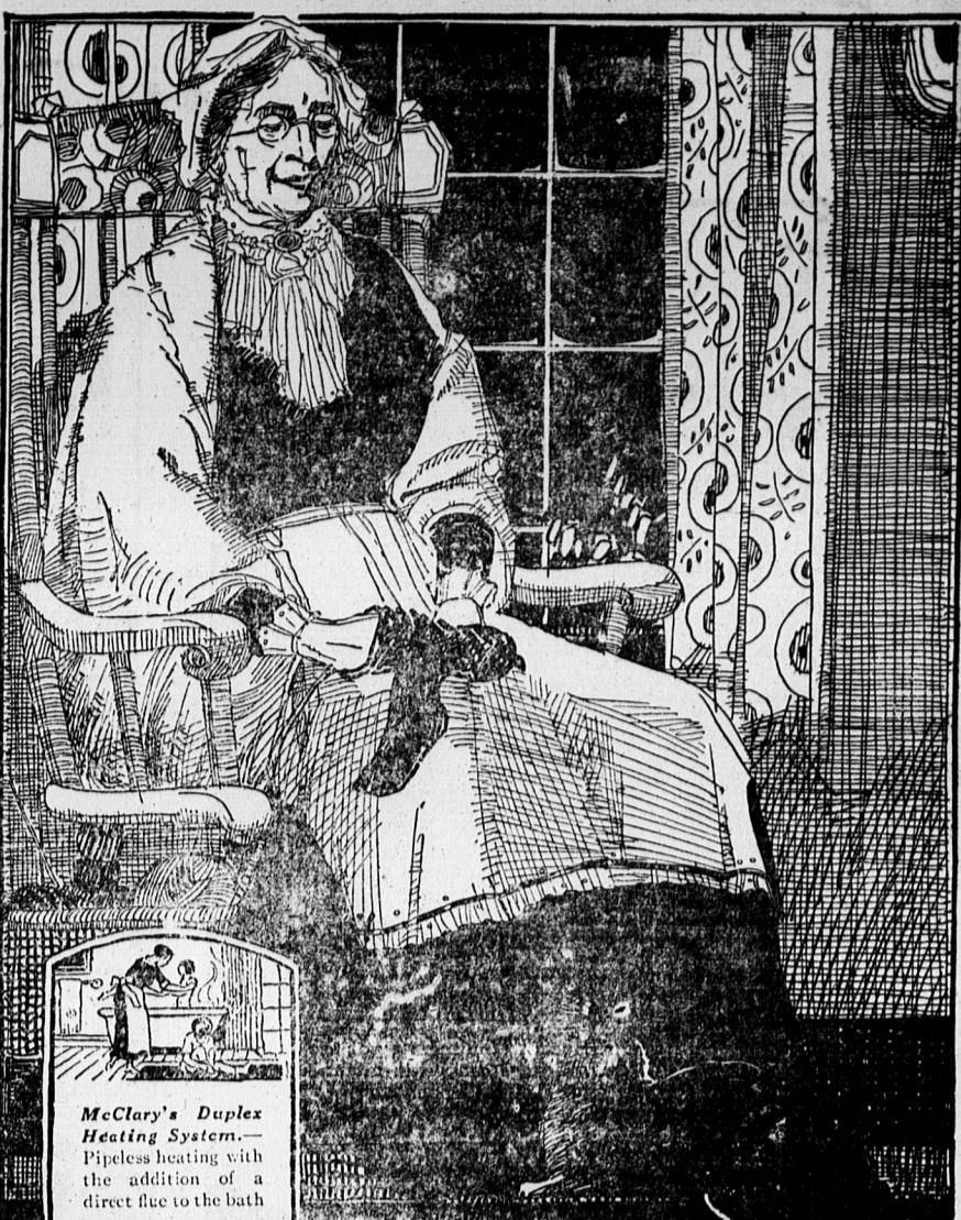
McClary's Duplex Heating System.—Pipeless heating with the addition of a direct flue to the bath room.