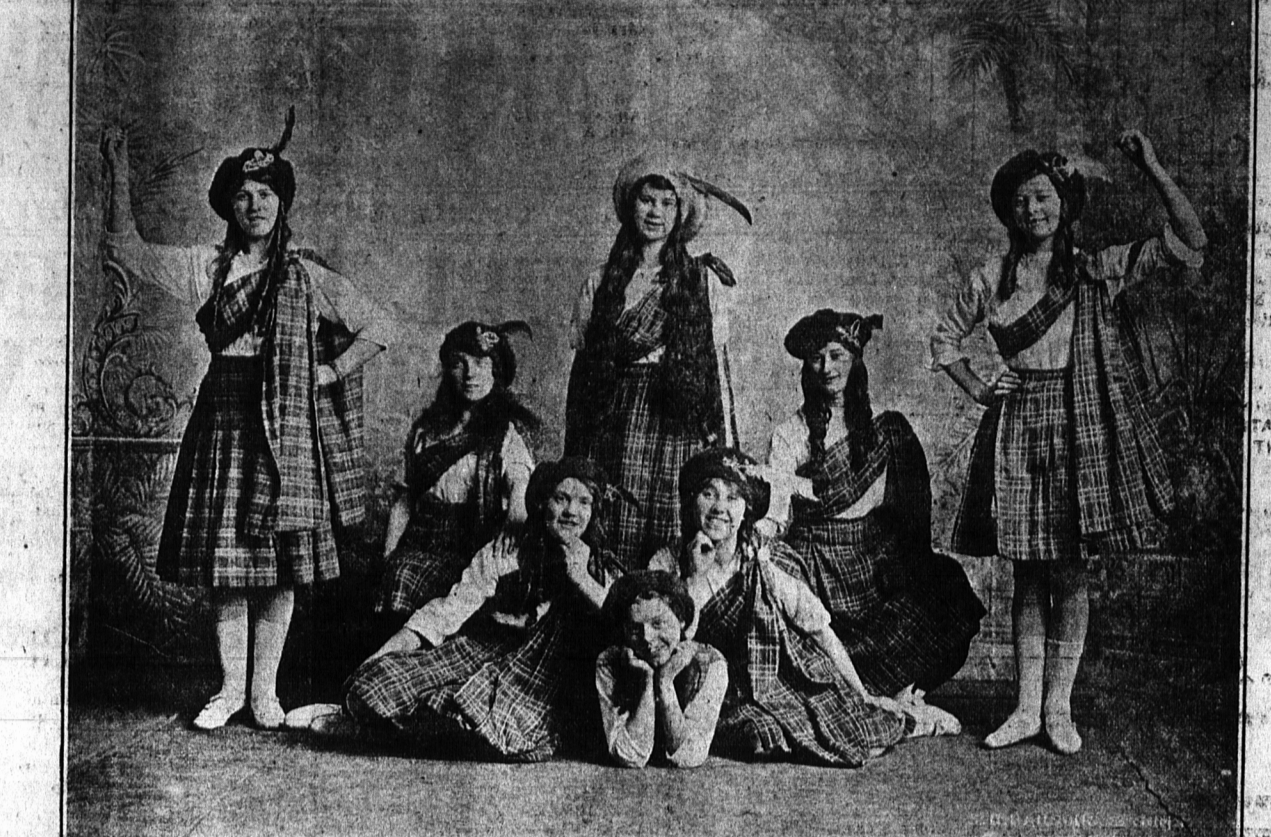
A Group of Fine Dancers Who Appear in Tonight's Play Jack The Piper's Son