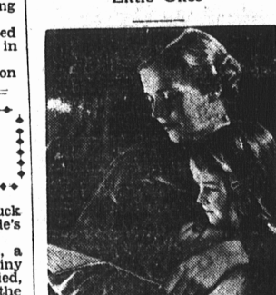
Children Love Simple Verse

Was there ever a little child who didn't love the musical rhythm and the bright warm words of the world's beloved poems? Watch the happy looks on young faces as you read James Whitcomb Riley's: "The husky, rusty rattle of the tassel of the corn. And the raspin' of the tangled leaves, as golden as the morn'."