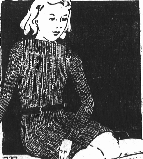
GIRL'S KNIT DRESS NO. 727

Miss Aimes receives at least 200 votes for each design before it is accepted for this column. Send us your votes. We print all the popular designs.