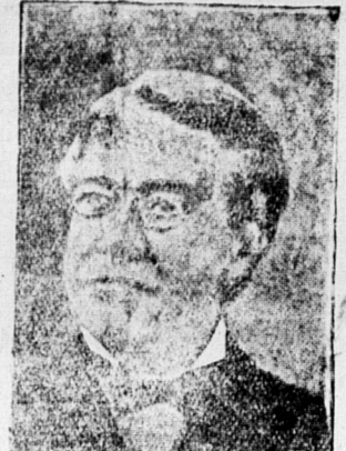
SAMUEL GOMPERS, President of the American Federation of Labor who supported Bryan in the last Presidential Elections in the United States and who has been re-elected President of the Federation of Labor.