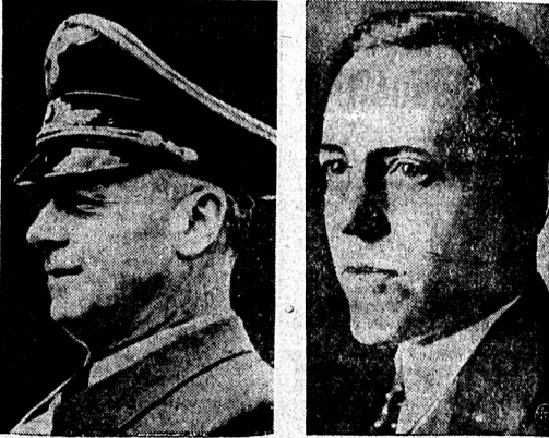
Adml. Karl Doenitz has removed Joachim von Ribbentrop, left, longtime high Nazi, as German Foreign Minister, replacing him with Count Ludwig Schwerin von Krosigk, 58, right, nephew of the Kaiser Wilhelm.