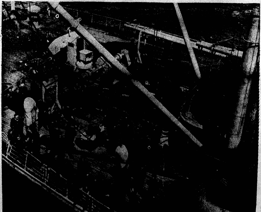
After years of sacrifice, hardships and the horrors and triumphs of warfare these Canadian soldiers come home. They have vanquished the Nazi superman and now they're just waiting aboard ship for the order to disembark. It's a bright day in port and the army photographer caught the men in an informal—and rather impatient—pose. The majority have receipts for Eighth Loan Victory Bonds in their pockets, too.