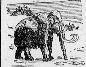
A mammoth or "hairy elephant"

Most mammoths were about the same size as modern elephants, but some reached a height of 13 feet. The tusks were long, sometimes measuring more than 12 feet. A single tusk has been known to weigh 200 pounds.