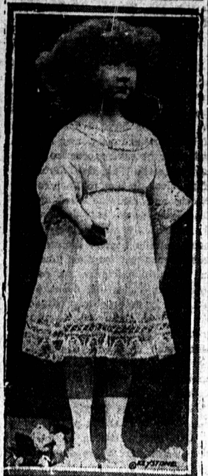
Princess Marie Jose of Belgium was the model for this doll which has become very popular in her own country and France as well. The doll looks almost exactly as King Albert's only daughter did several years ago. She is now fourteen years old.