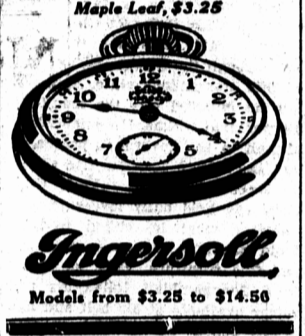
Ingersoll Models from $3.25 to $14.50