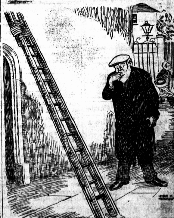
Dilemma of superstitious Scot who sees a penny lying under a ladder!

The famous Waterloo Bridge in London, England, is closed for repairs. The bridge actually started to sink as may be seen in this photograph. As a result other bridges in London are overloaded with traffic.