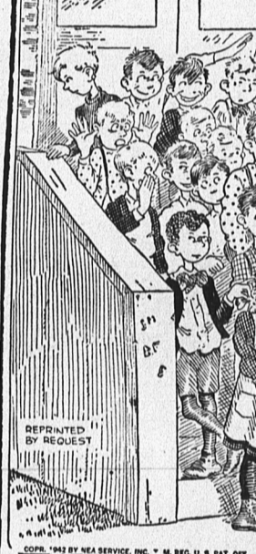
MOMENTS WE'D LIKE TO LIVE OVER—FIFTH GRADE PHOTO.