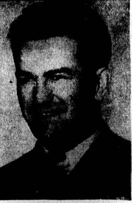
WING COMMANDER J. ANGUS MACLEAN, D. F. C. Candidate for Queen's County

THE Mackenzie King Government is bragging about Canada's fine war record . . . THIS Record is not a Government record . . . It is that of Canada's sons and daughters in the Armed Forces, her Farmers, her Fishermen and her War Workers . . . THEY Are the ones responsible for the country's wartime achievements IN SPITE of the Government's efforts to bungle every important issue raised by nearly six years of conflict . . . AND Yet, today, the Liberal Government wants to be allowed to keep on muddling through and trying to bungle the biggest job of Social and Economic Reconstruction ever faced by Canada . . . YES . . . IT'S TIME FOR A CHANGE VOTE PROGRESSIVE CONSERVATIVE AND elect these four men