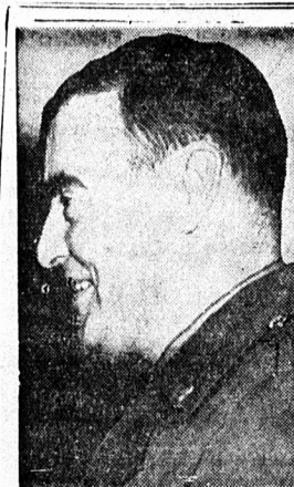
GETS NEW COMMAND

Toronto Man Declares Most Of Jerries Drowned In Channel.