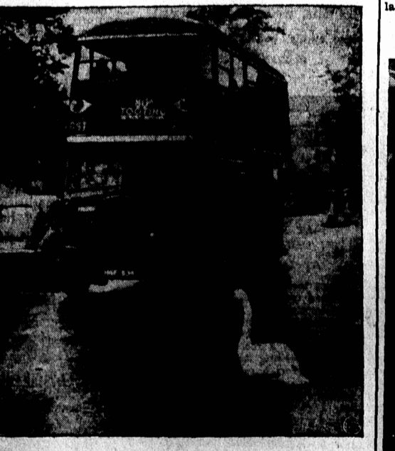
"What a glorious day for stopping traffic," this swan must have said to itself, as it flew in from a river and alighted on a busy street in Mitcham, England. And stop traffic it did, until a policeman took it into custody. The bird was returned to the river, its yen to be a traffic cop presumably cured.