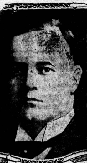
HON. E. J. MANION Minister of Railways and Canals.