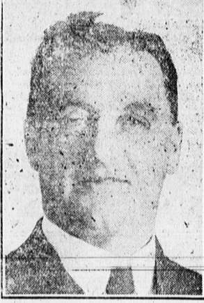
Grew World's Champion Wheat

NEW YORK, Dec. 22.—It seems unusual to look for fashions in a bathhouse, but where else except on the legs of a buff cochin could the vogue for feather decorated garters have originated?