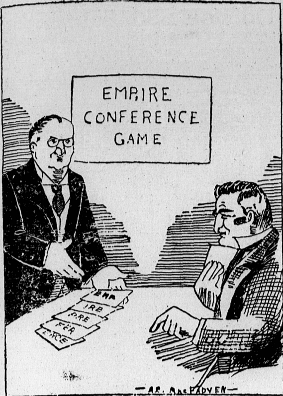
HON. R. B. BENNETT—There is no sleight-of-hand here John, all my cards are on the table. JOHN BULL—Yes, but I'm thinking it will be a long time before Ramsay will follow suit—Worse luck.