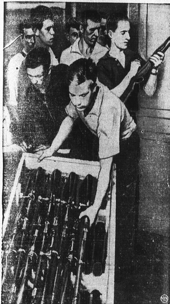
This Soviet youth is pressing out rifles to members of a civilian "exterminator battalion" in a Russian town, according to Soviet-censored caption on the picture, flashed from Moscow to New York. "Exterminator battalion" is a Russian euphemism for sharp-shooting snipers who lurk in buildings in Nazi-held towns and pick off German soldiers as they approach.