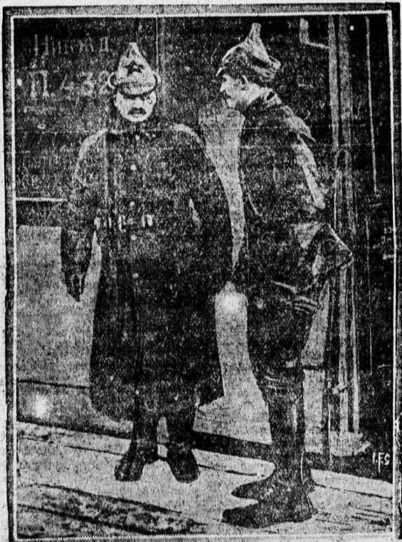
Here is an exclusive photograph of Leon Trotsky, Bolshevik Minister of War, made when he arrived recently in Petrograd from Moscow. It has just been received from Russia.