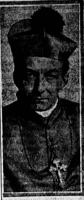
Archbishop George Mundelein. Although the Vatican has announced that Archbishop Dennis J. Dougherty, of Philadelphia, will be the only American cardinal created at the consistory to be held in March, it is almost certain that the red hat will soon be bestowed upon Archbishop George Mundelein, of Chicago.