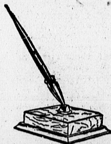
A GIFT AS POPULAR AS CHRISTMAS

In a word, Waterman's dealers are equipped with a Number 7 tray, consisting of 7 pens, with 7 different points at seven dollars. The Lucky One receiving your Christmas offering may visit the nearest Waterman dealer and exchange the nib for one best suited to their style of handwriting.