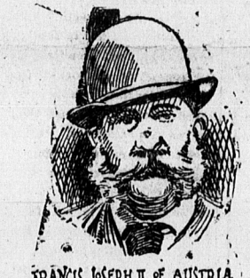
FRANCIS JOSEPH II OF AUSTRIA