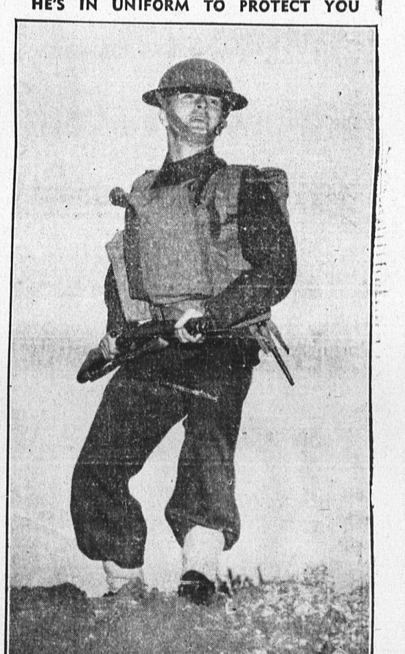
The Canadian Soldier, now recognized as the most vital link in the Canadian Military machine, although up to now he has had far less glamorous duties to perform than his brothers in the Royal Canadian Navy and the Royal Canadian Air Force will be honored throughout Canada during Army Week, June 29 to July 5.