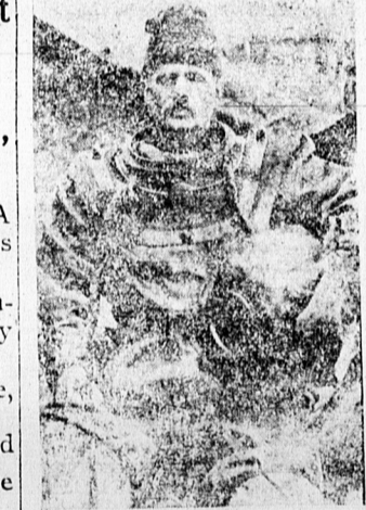
A. DIVER, MARITIME PROVINCIAL SECURITIST.