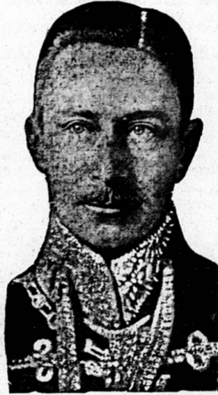
GERMAN CROWN PRINCE.