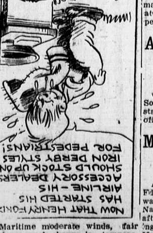
FOR PEDESTRIANS! SHOULD STOCK UP ON IRON DERBY SHOES! HAS STARTED HIS AIRLINE - HIS ACCESSORY DEALERS!