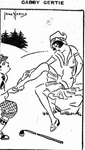
"Contrary to general belief, no sap will run when a limb is bruised."