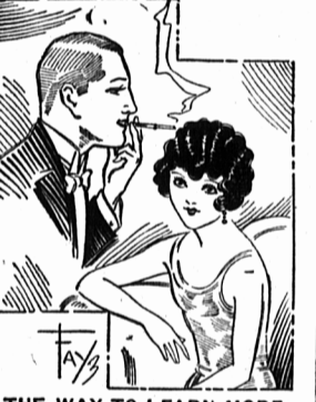
THE WAY TO LEARN MORE. She: Don't you think you learn a lot by talking to people? He: Not as much as by letting people talk to you.