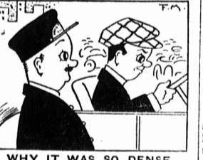
WHY IT WAS SO DENSE. Motorist (complainingly): Why is traffic so dense at this point? Traffic Cop: Because the law allows so many dense drivers to own cars.