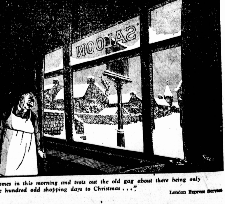
"Now the first one who comes in this morning and trots out the old gag about there being only three hundred odd shopping days to Christmas..."